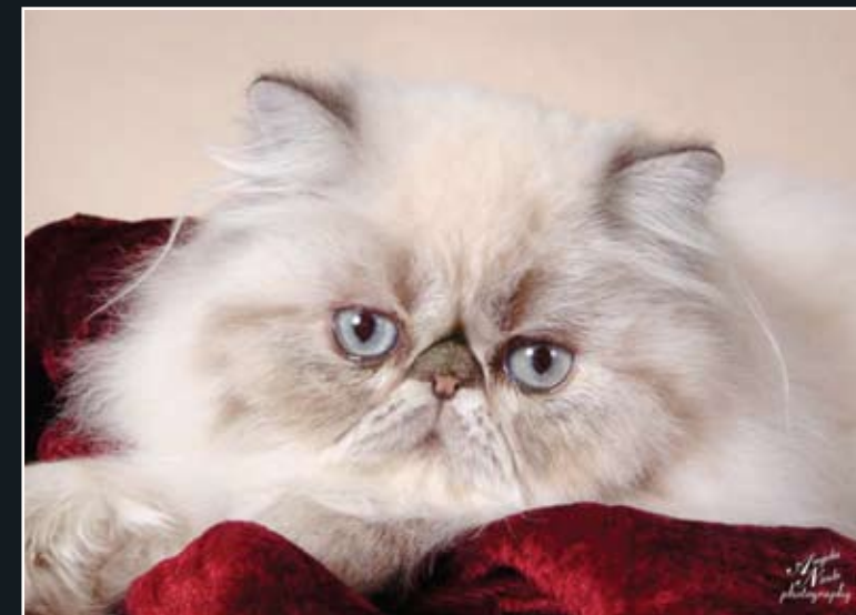
Laurenden Suri of Catortionist Seal lynx point Himalayan Exotic Longhair female kitten.

As a point of reference, the Himalayan GC, BW,