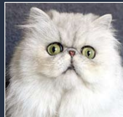
Diehl Love At First Bite Shaded silver Exotic Longhair female

Proposed: COAT: Exotic Shorthair: dense, plush, soft and full of life. Standing out from the body due to a rich, thick undercoat. Medium in length. Acceptable length depends on proper undercoat. Cats with a ruff or tail-feathers (long hair on the tail)