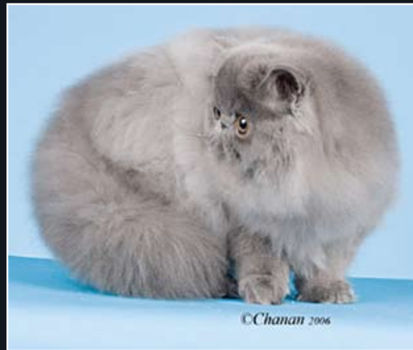
Ormerys Orsetta, JW Blue classic Exotic Longhair female

This genetic analysis and the associated statistics assume that there is no selective