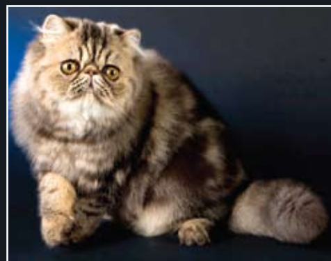
Ormerlys Woody Austin Brown classic tabby Exotic Longhair male kitten (pictured at age 8 months)

When a cat receives two copies of the broken gene, it not only will be incapable of producing the