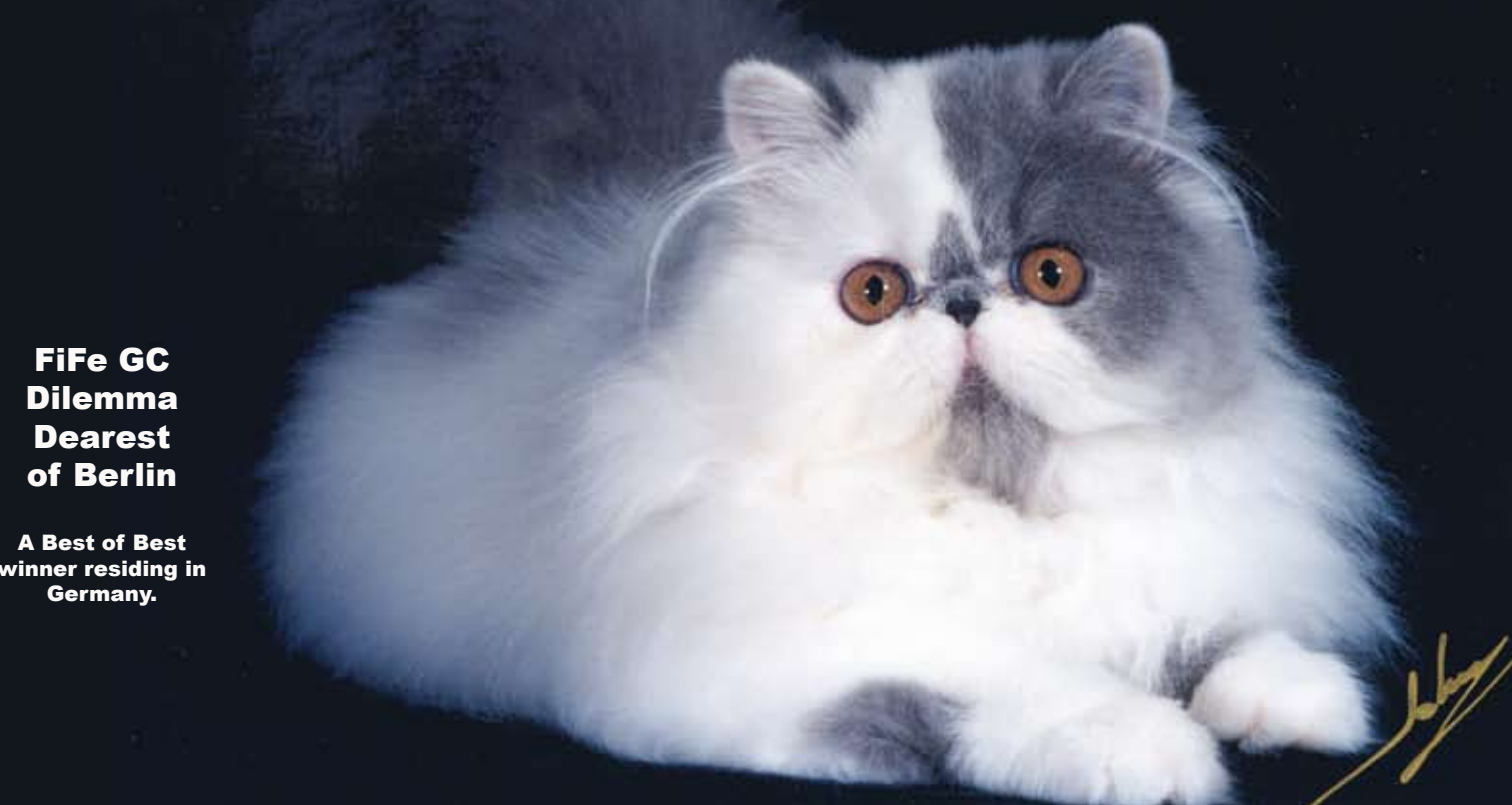
FiFe GC Dilemma Dearest of Berlin