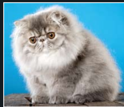
GIC Ormerlys Karl Gustaf Blue spotted Exotic Longhair male (granded as a Persian)

It should be noted that the crosses to Burmese occurred prior to the widespread distribution of the birth defect commonly known as the "Burmese head defect" throughout that breed.