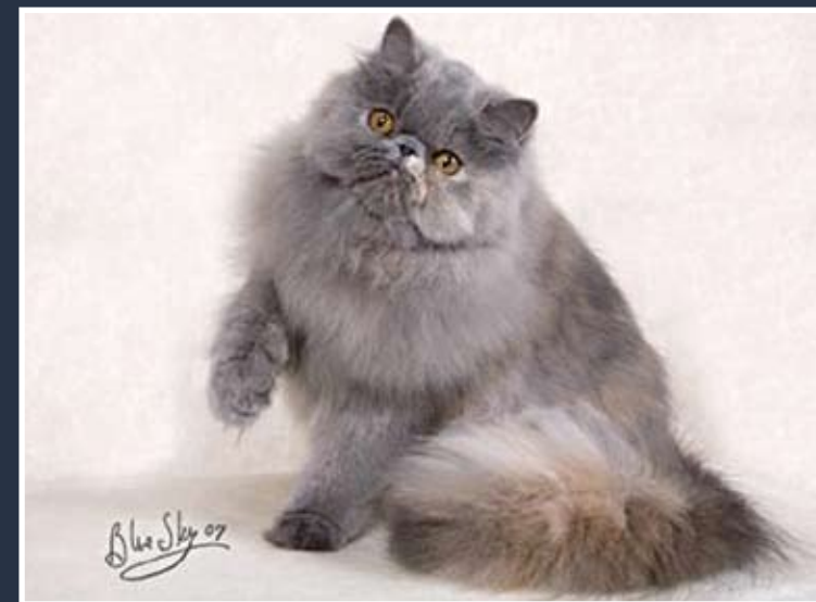
Milbury Bridge Mixture Blue-cream Exotic Longhair female.